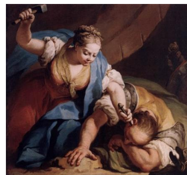
Jacopo Amigoni , _____ and Sisera, 1739

HINT: There are no hints! This is a tough one unless you are well versed in the Holy Scriptures and can remember names very well. I honestly could not remember her name, but I knew the story and I loved the Catholic understanding of this as a prefiguration of our Virgo Potens! If you have never read the book of Judges, I highly suggest