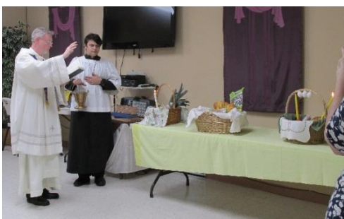
May Crowning Sunday, May 9 th 11:30A.M.