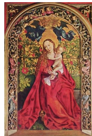
Madonna of the Rose Bower, Martin Schongauer, 1473

The queen of flowers, the rose, which is associated with Marian apparitions, has long symbolized her mystical connection to the Trinity and heavenly joy when worn as a crown by saints. Some rose varieties have names associated with Mary. In simplistic secular terms, the rose symbolizes love.