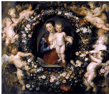
Madonna in Floral Wreath, Peter Paul Rubens, 1620