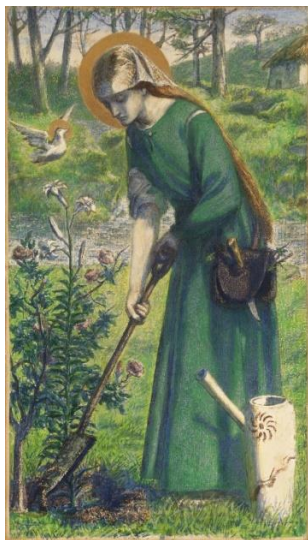
Mary Nazarene, Dante Rossetti, 1857

Early Medievalists started the tradition of a Mary's garden filled with fruits, vegetables, herbs, and flowers that they saw as symbolizing some aspect of either Jesus or Mary. St. Benedict had a rose garden (called a rosary) at his 4 th century monastery, but it was 7 th Century St. Fiacre who first specifically gave his garden to Mary. How many of the plants you grow have a hidden connection to Jesus or Mary? MaryGardens.com : flowersforourlady.com