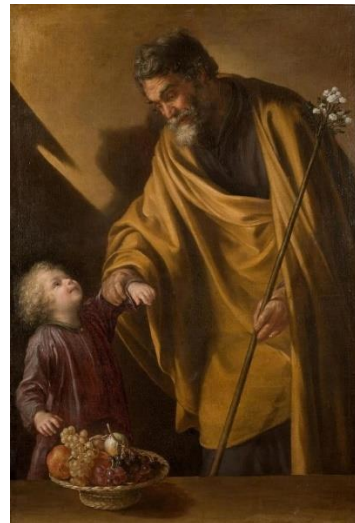
"St. Joseph with the Christ Child," Sebastián Martínez, ca. 1650

Was St. Joseph really such an older father to warrant being portrayed with white hair? He was 33 at the time of espousal to Blessed Mother. St. Joseph's iconography include one or more of three symbols: Infant Jesus, carpentry tools, and a lily-tipped staff. When his heart is represented, it is surrounded by lilies.