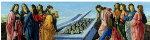
Botticini's "Assumption of the Virgin" flower-filled grave detail National Gallery, London, England

We also have an additional way to donate through Paypal. This can be done through my new email: kevinmcla@unavocejax.org .