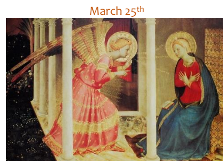
Fra Angelico's "Annunciation and Scenes from the Life of the Virgin" (cropped) Museo Diocesano, Cortona, Italy

https://www.ewtn.com/catholicism/devotions/litany-of-st-joseph-247