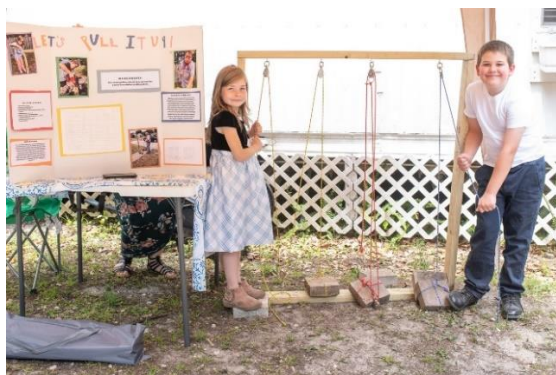
Pictured is a Simple Machines demonstration from our 2021 Science Fair presented by [REDACTED].

The students are currently gearing up for their annual Science Fair which will be held on Sunday, March 13th following the 10:00 a.m. Mass at St. Michael the Archangel Church. We are looking forward to all of the experiments that our budding scientists will have to offer visitors to our fair!