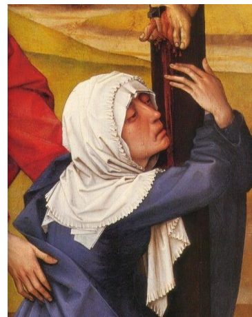
Rogier van der Weyden, close-up of "Crucifixion Triptych," c. 1445

~ The Mother of Sorrows to St. Bridget of Sweden