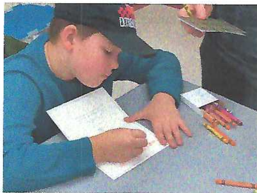
[redacted] St. Michael's